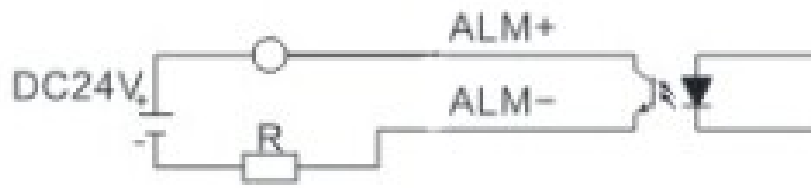
Alarm in place output wiring diagram