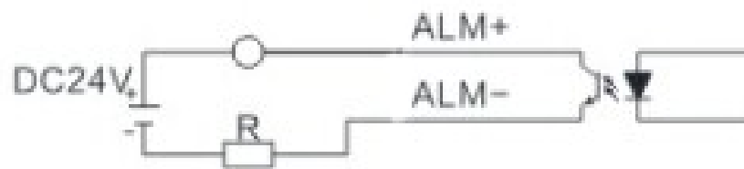
Alarm in place output wiring diagram

The driver uses a six-digit DIP switch to set the subdivision and motor rotation direction. The detailed description is as follows: